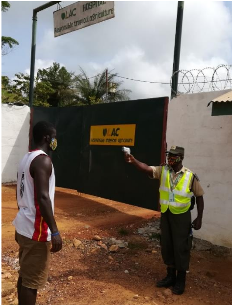
LAC Hospital gate with thermometer