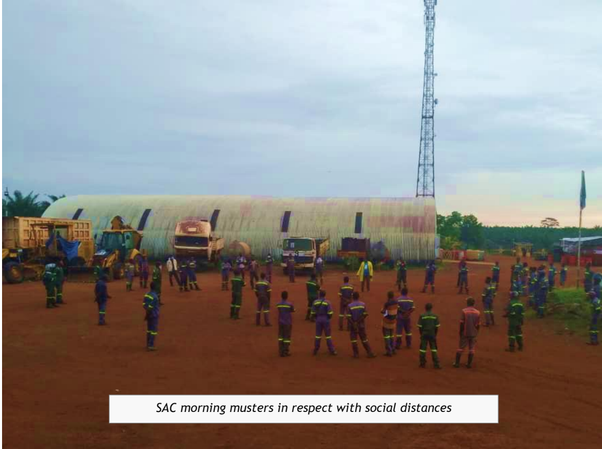
SAC morning musters in respect with social distances