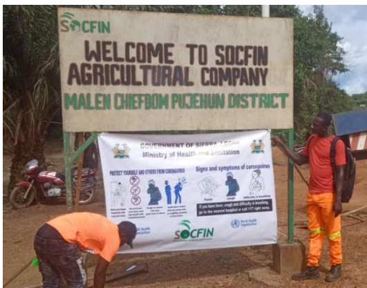
Banners placed at workshops & operations sites by SAC in collaboration with the Ministry of Health