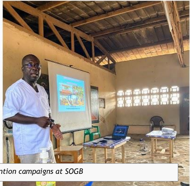
Awareness and prevention campaigns at SOGB