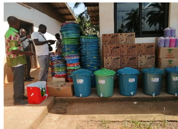
Donation of sanitary kits to neighboring villages, SOGB, Côte d'Ivoire