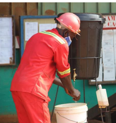
Hand washing point, Safacam, Cameroon

Socfin has followed – and sometimes was ahead of – the guidelines formulated by the respective governments.