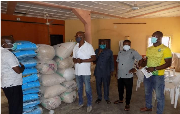
Covid-19 donations from Okomu