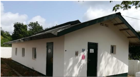
LAC hospital quarantine center