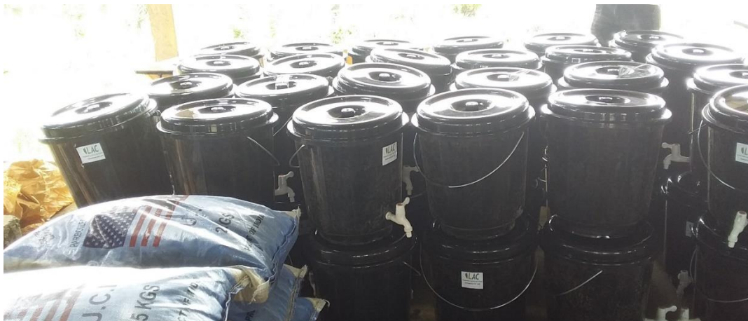
Distribution to local communities of 300 faucet buckets and other items