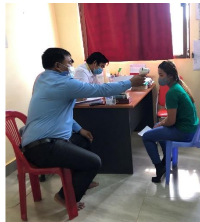
Medical check-up with authorities after Khmer New Year, Cambodia