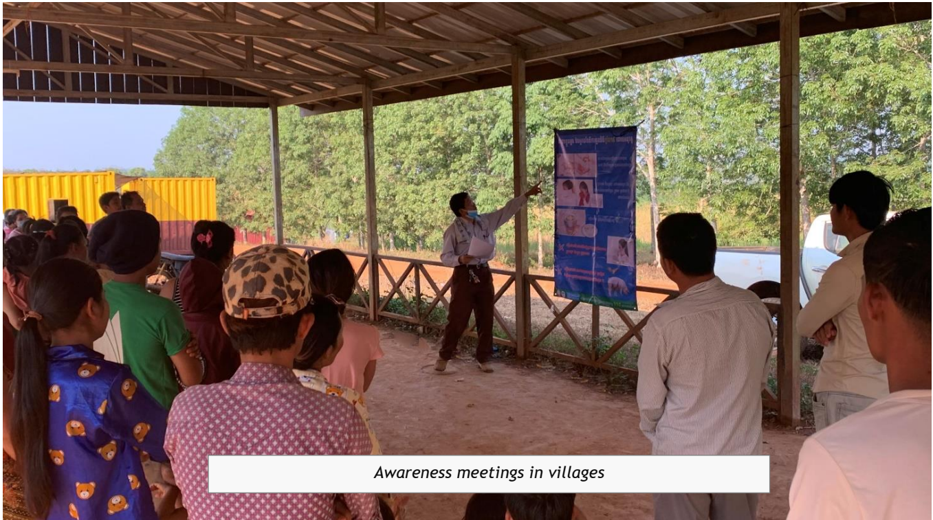
Awareness meetings in villages