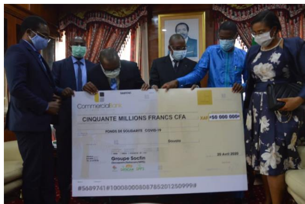
50 million fCFA contribution to Cameroon funds to fight Covid-19