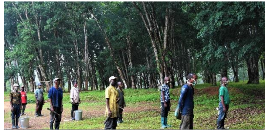
Social distances between workers