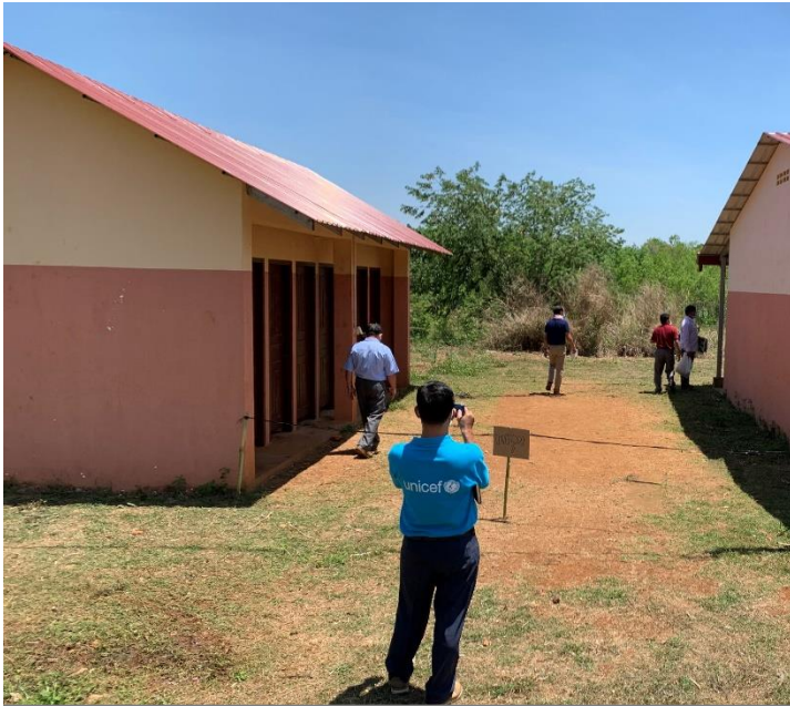
Visit by UNICEF and Health Department of Socfin Cambodia