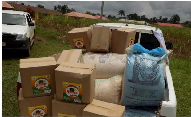
Relief materials donated to members of Ofunama Community