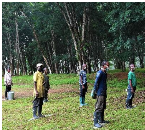
Social distances between workers, LAC, Liberia