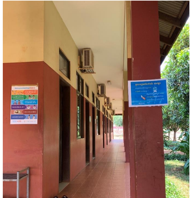
Awareness information at the office