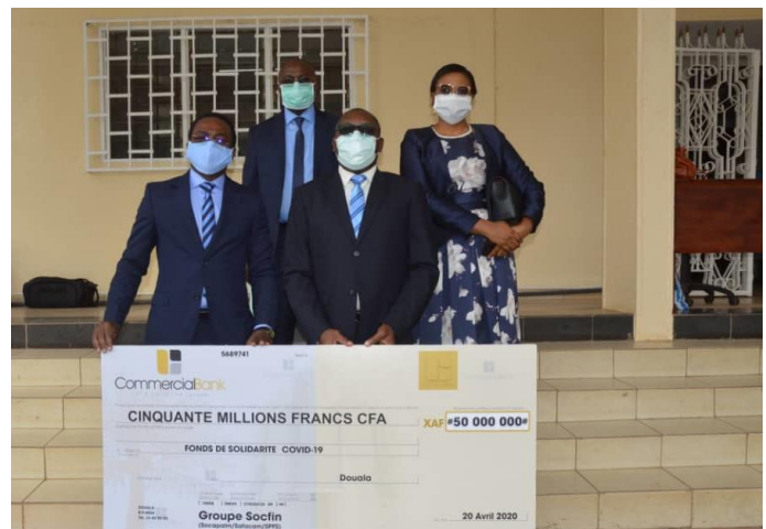
50 million fCFA contribution to Cameroon funds to fight Covid-19