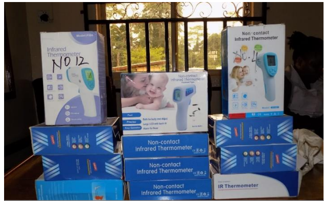
Purchased thermometers to screen workers and visitors