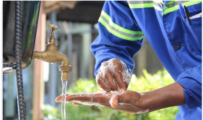
Hand washing point, Safacam, Cameroon

“We demand justice and safety for workers on Socfin’s rubber/oil palm plantations during the Covid-19 pandemic”