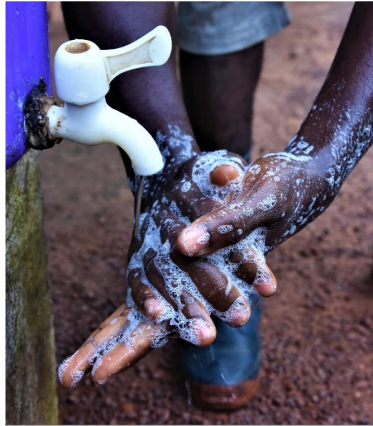
Hand washing point at LAC