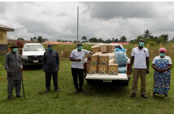
Relief materials donated to members of Ofunama Community, Okomu, Nigeria