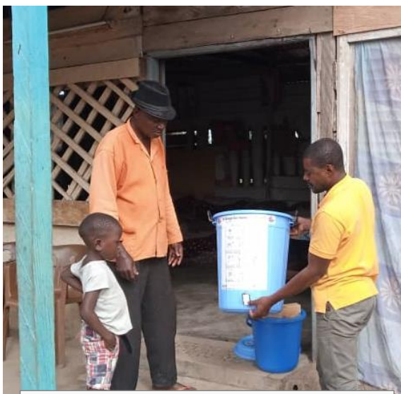
Donation of hand washing point at Socapalm