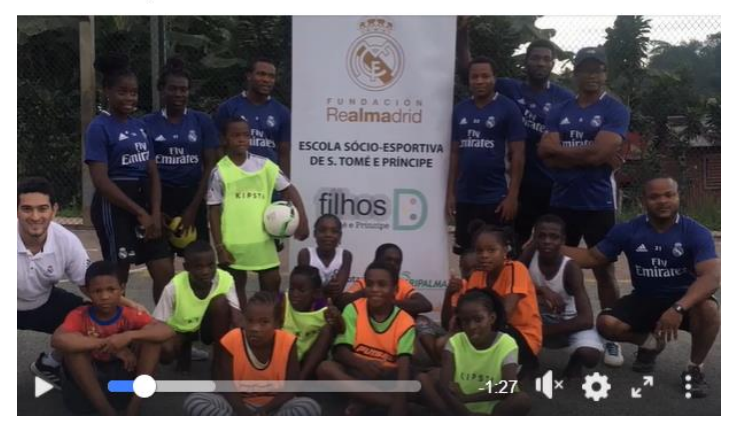
Example of a publication on Agripalma Facebook's page

Formação de treinadores da futura escola Socio Desportiva Da Agripalma com a Fundação Real Madrid.