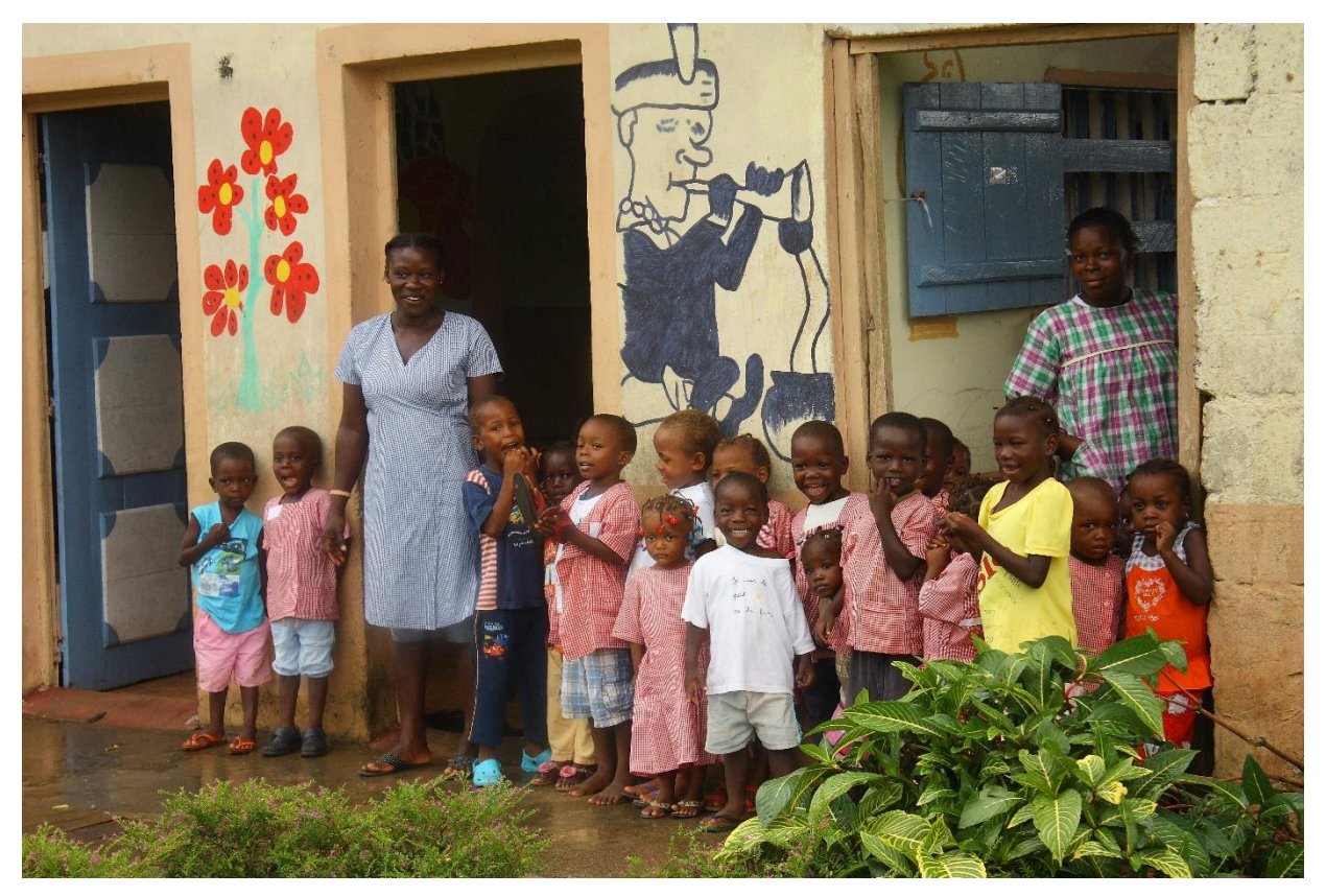
Crèche, Agripalma, Sao Tome