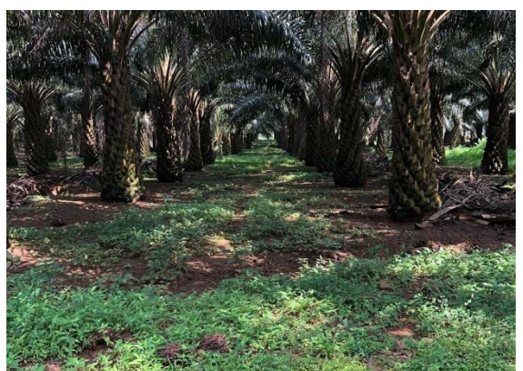
Alley of palm trees, Agripalma organic plantation

The people of the Caué district always worked on the old colonial farms, which after the independence (1974), went down until they were abandoned.