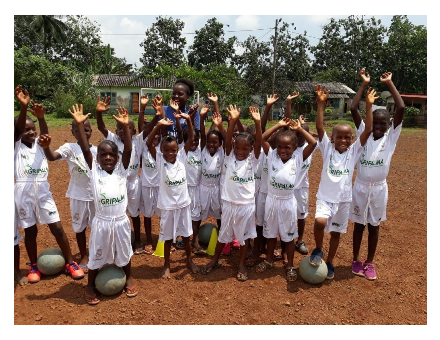
Children integrated to the Real Madrid Foundation team

Its main objective is to promote, both in Spain as well as abroad, the values inherent in sport, and the latter's role as an educational tool capable of contributing to the comprehensive development of the personality of those who practice it. In addition, as a means of social integration of those who find themselves suffering from any form of marginalisation, as well as to promote and disseminate all the cultural aspects linked to sport.