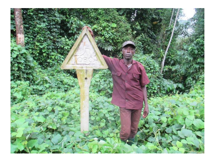
ÔBÔ National Park

Agripalma is also used as a buffer and protection zone to monitor and protect the ÔBÔ National Park mostly to prevent illegal hunting and logging.