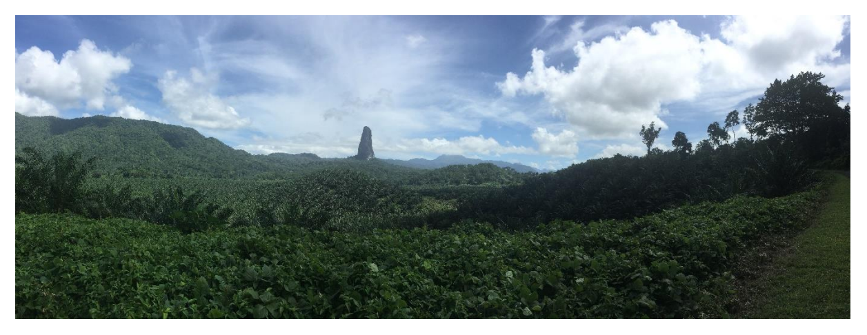
Oil palm plantation, Agripalma, Sao Tome